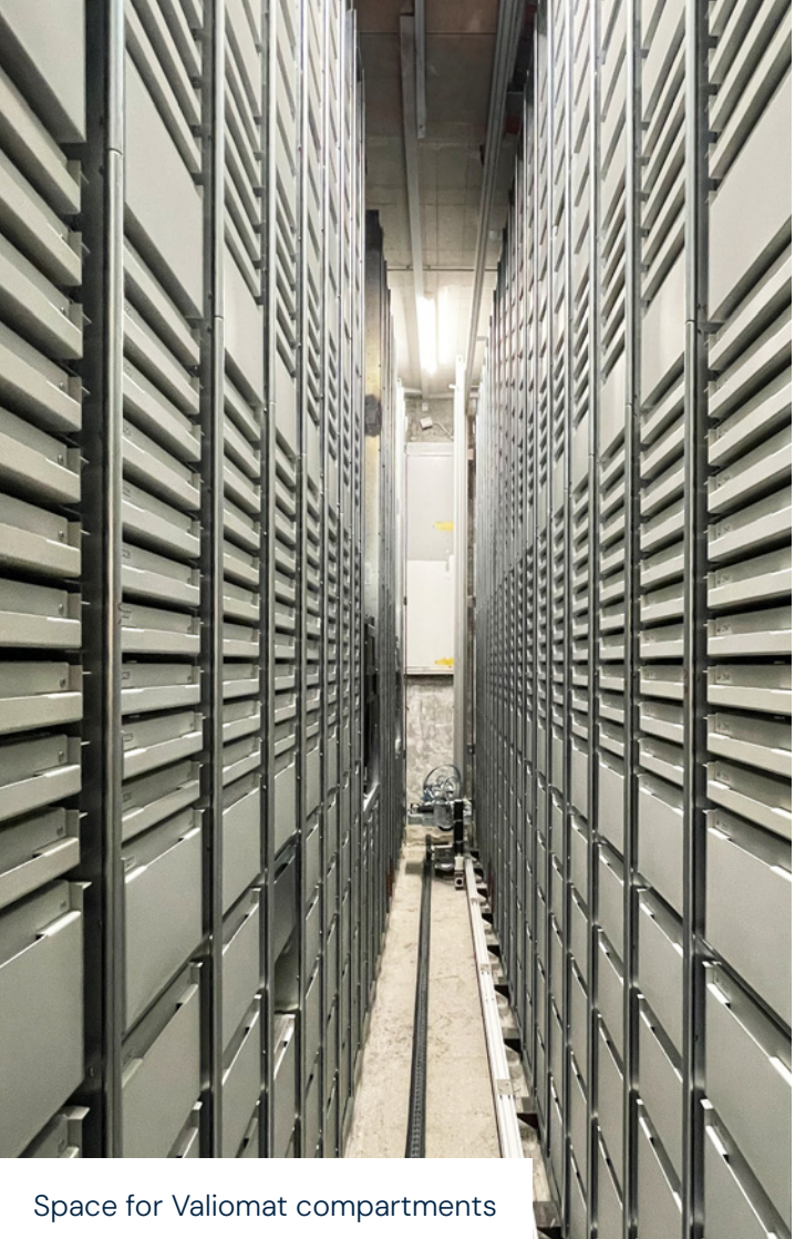
Space for Valimat compartments