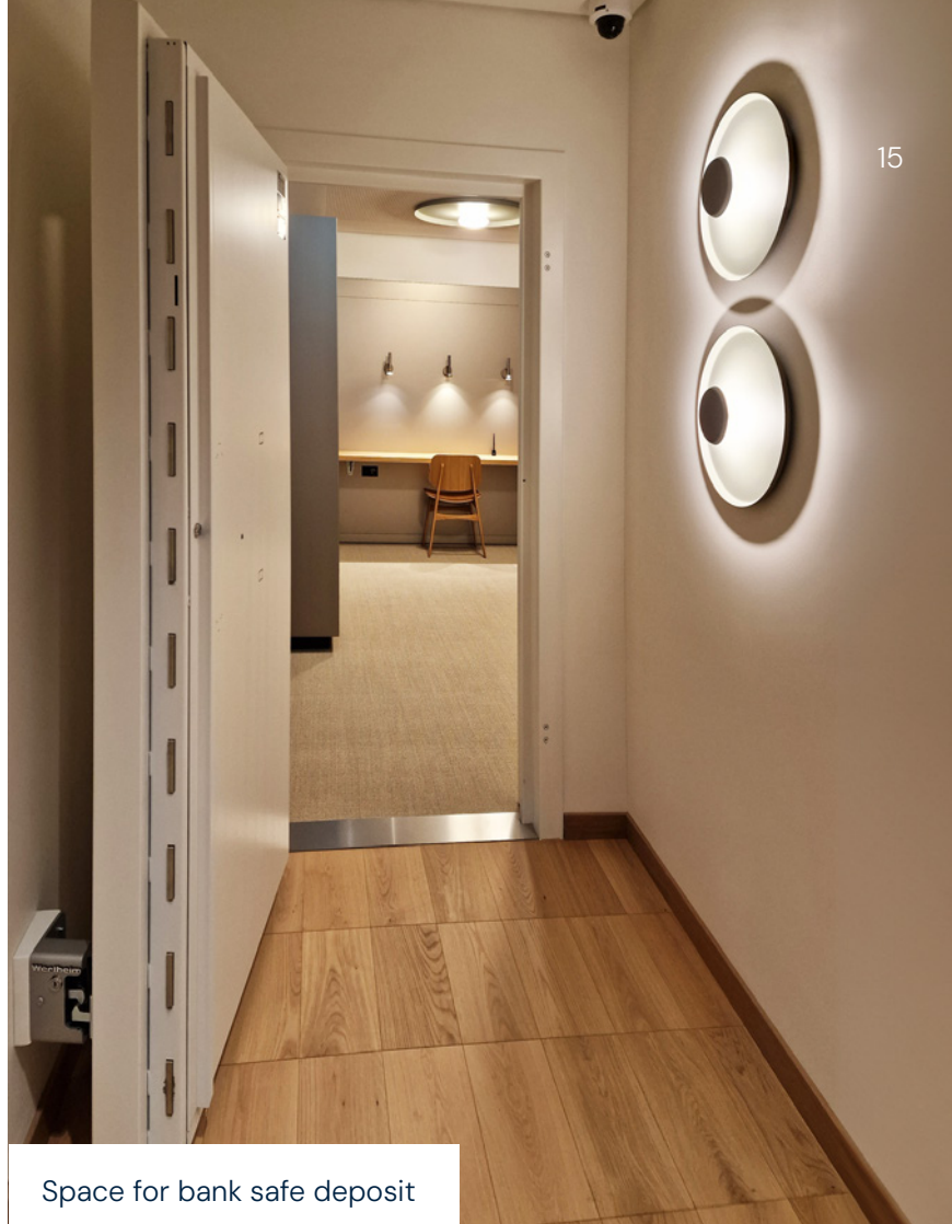
Space for bank safe deposit