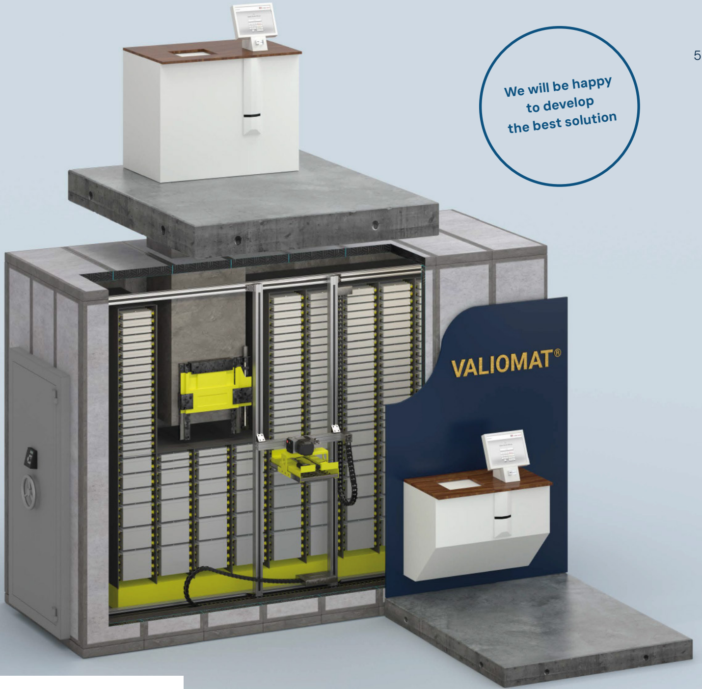
Ground floor system with issuance from front or side

We will be happy to develop the best solution