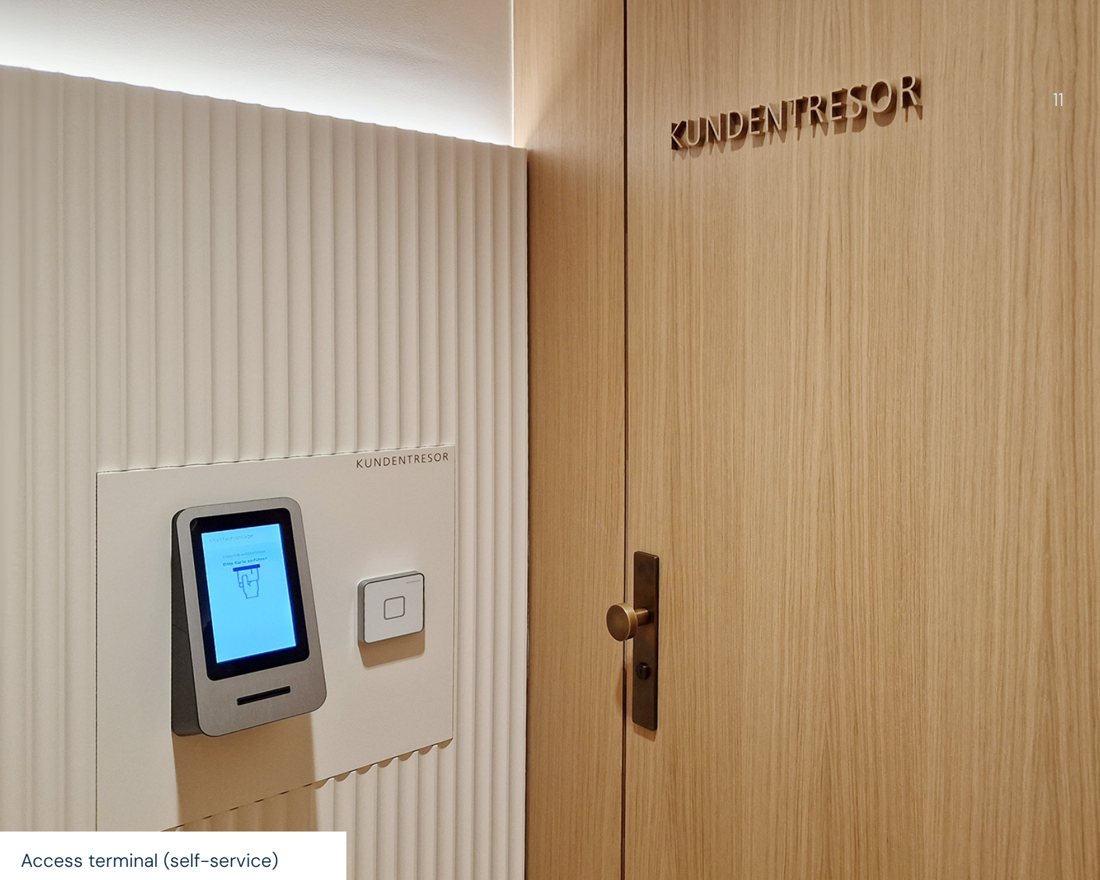
Access terminal (self-service)